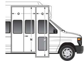
Double APD Door

* Dependent on combination of which entry door width and lift door width chosen.